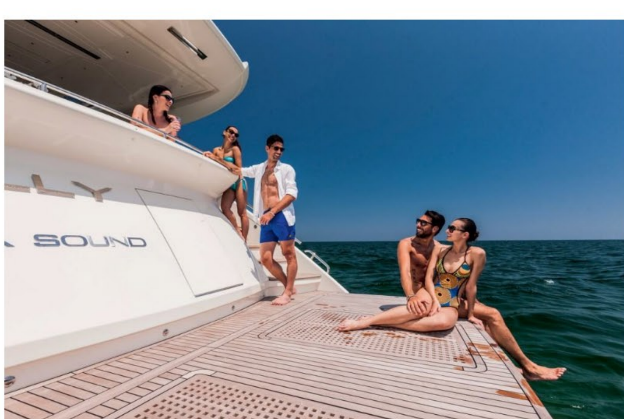
Dominator yachts are personalized and special, making their owners part of the family

Ever since five years ago Dominator got a new ownership structure, they've been bending themselves backwards to please the client, offering in addition to mere customizable delights some of the best technical solutions on the market. Dominator 800 shows what the yard is capable of when no limits are set.