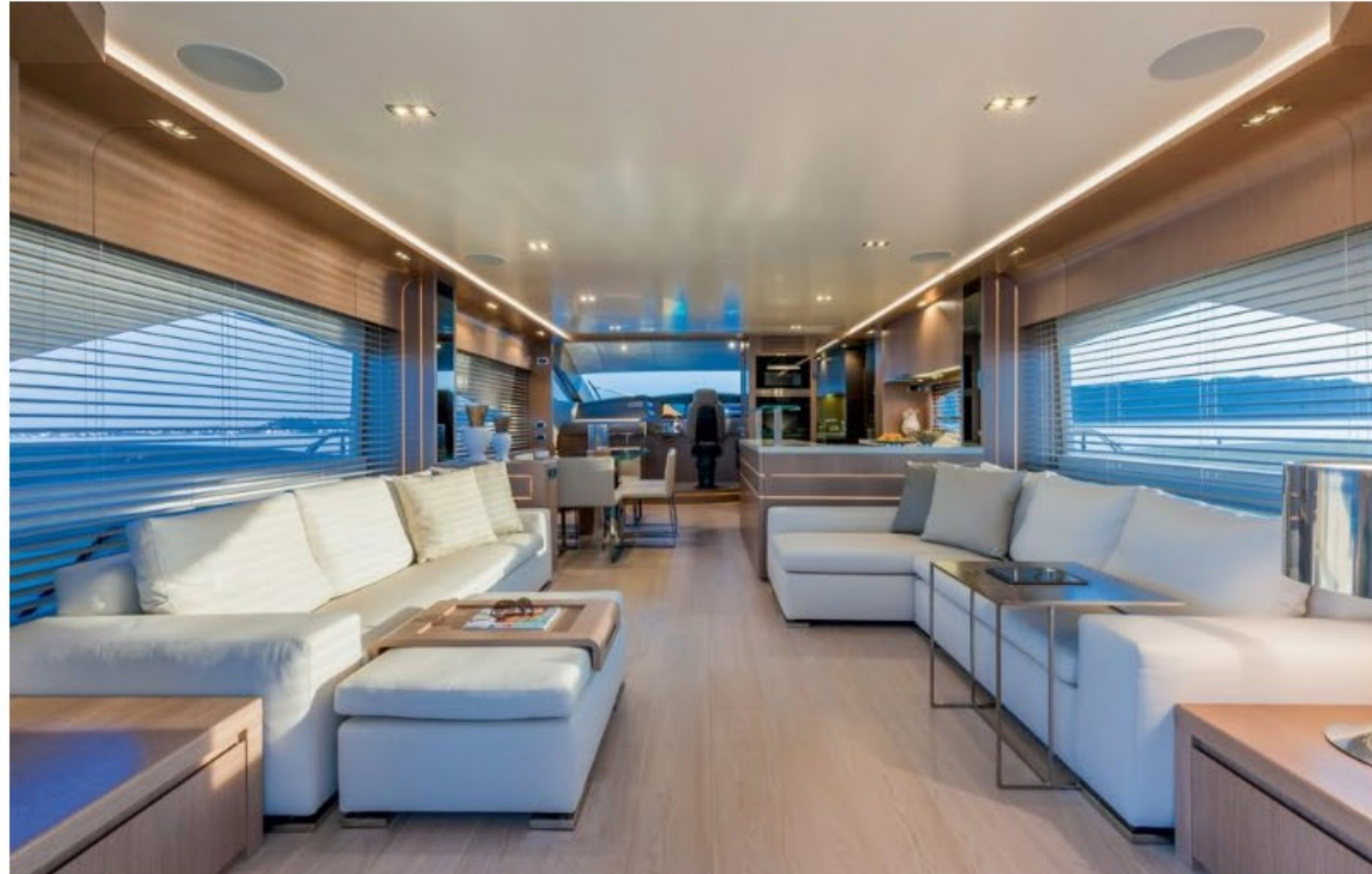
The salon enjoys a lot of natural light

In addition to all these lovely, but to most owners invisible improvements, Dominator 800 offers plenty of other new delights to be seen and enjoyed, the first among them design and aesthetics.